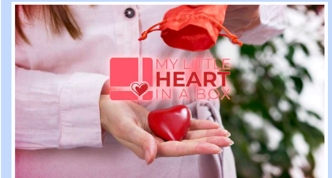
My Little Heart In A Box