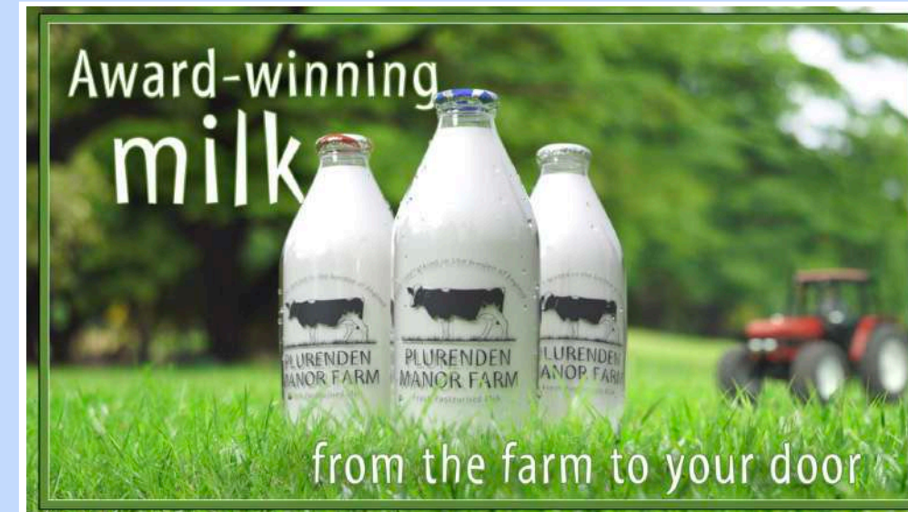
Plurenden Manor Farm