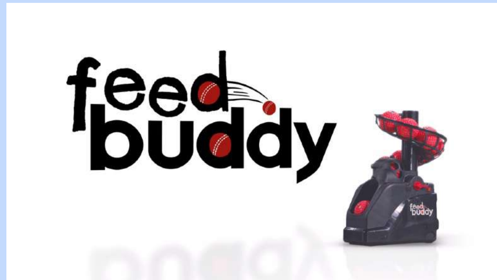
Cricket Feed Buddy